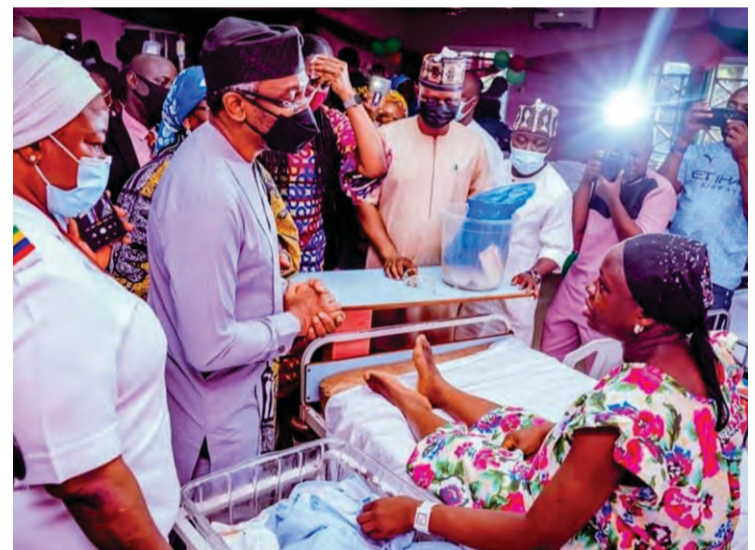
Visits the first baby of the year in Lagos

President Obasanjo to perpetuate his stay in office.