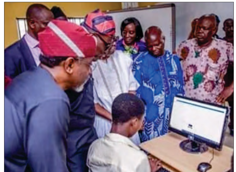
New ICT Center at Stadium High Sch