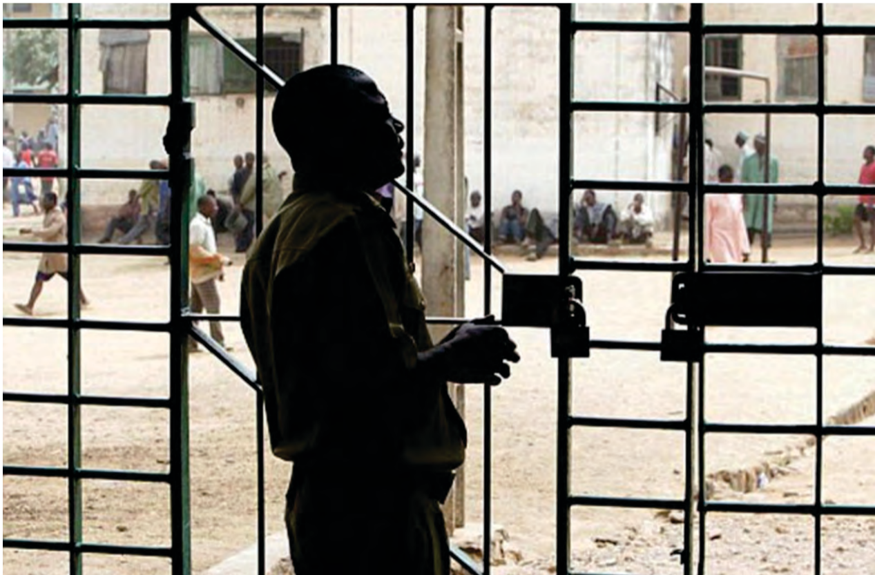
long detention without trials