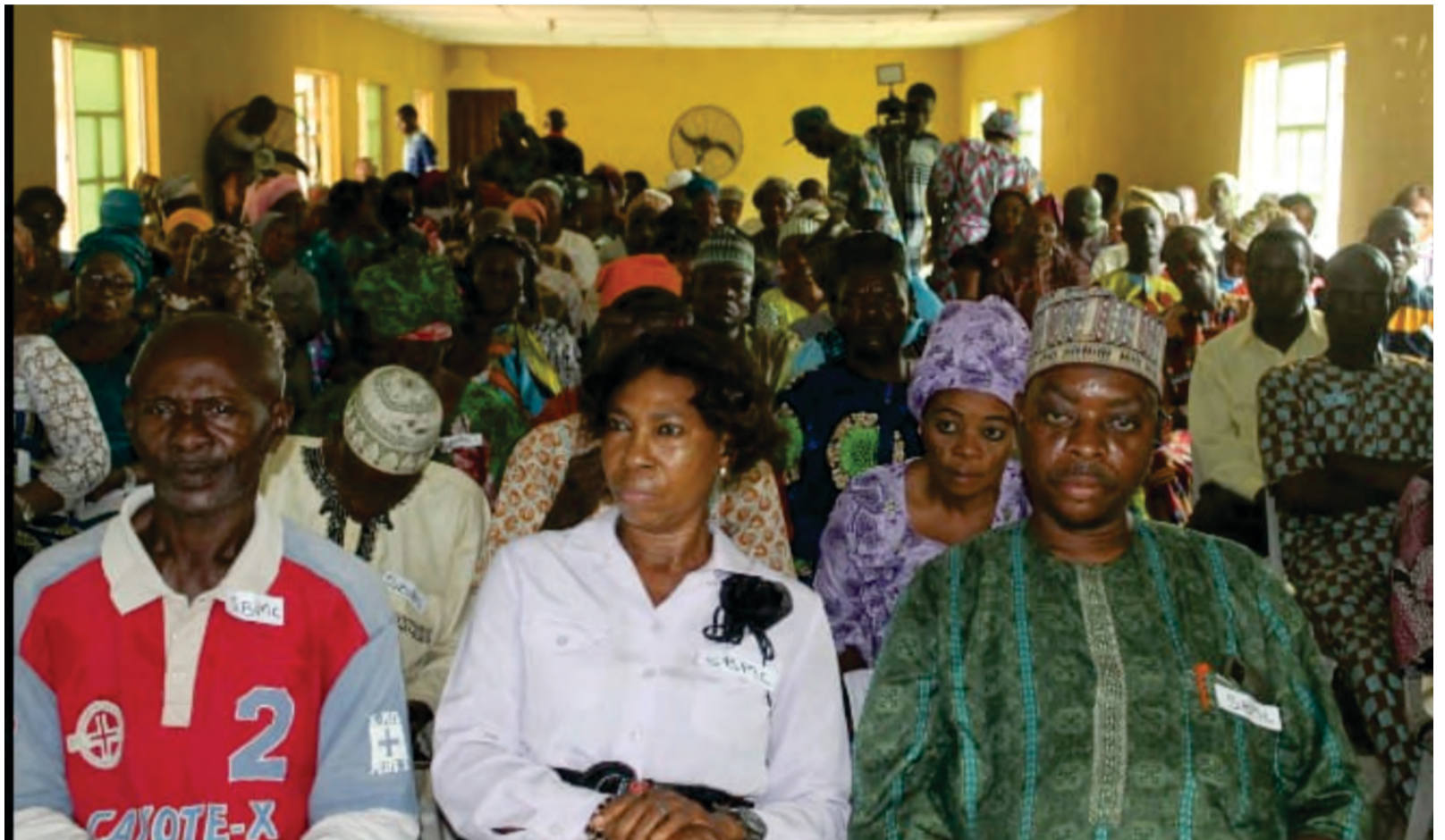
Participants at the training

The Education Secretary stated that the training was ordered by the Lagos State Universal Basic Education Board. After engaging all the Heads of Sections and School Social Mobilisation in Lagos State in a similar retreat that resulted in increasing their performance, he said the State wanted to bring the training to the local authority education stakeholders for effective performance so that they can also relate the training core values to their subordinates at their various