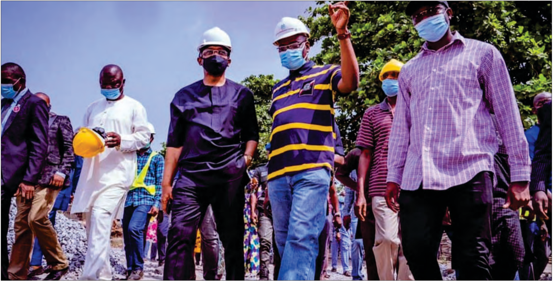
The visitation of the reconstruction and expansion work of Babs Animashaun road and bridge, and rehabilitation of network of seven roads at Ward F1, Surulere, comprising Nathan, Atan, Martins and Elizabeth Roads and others around Ojuelegba – Yaba axis.

Out of his personal resources, the lawmaker has established various programmes in his constituency to improve the lives of his primary constituents many of whom regard him as a true and worthy leader.