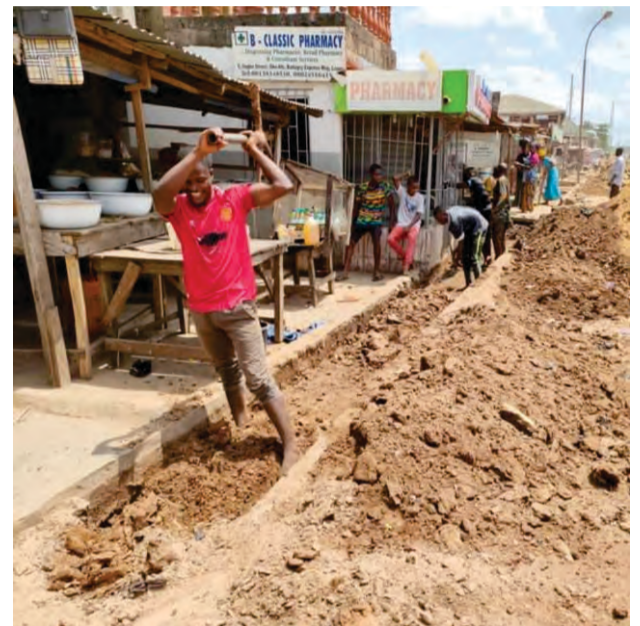
Ongoing drainage evacuation exercise at Olorunda LCDA

The council embarked on drainage evacuation to control dirty environment and flooding in the market. The management of the park were given clear directives to address the confusions regarding parking spaces for vehicles, while shading boundaries were established for traders. The heads of the various unions, including Tricycle, Okada riders as well as market leaders were also given clear instructions on how the park and market should co-exist onwards.