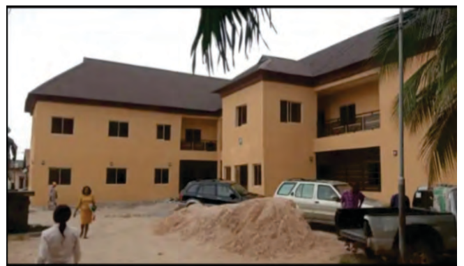
The newly constructed complex at Oto-Awori secretariat

At present, the construction is close to completion as work is ongoing to give the surrounding a befitting one.