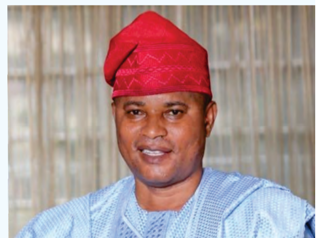
Hon. Wasiu Eshinlokun Sanni

He said the total number of votes cast was 304 without