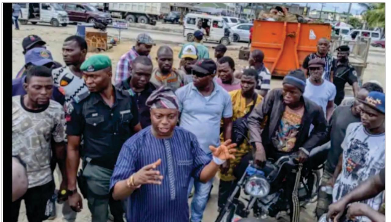
Hon. Abdullahi Olowa while addressing motorcycle operators in Ibeju-Lekki

unidentified criminals have come into their midst. He encouraged them to see a positive light to the directive rather than pursuing what is unnecessary. Olowa further promised to continue to put the residents in mind to relieve them of their burden.